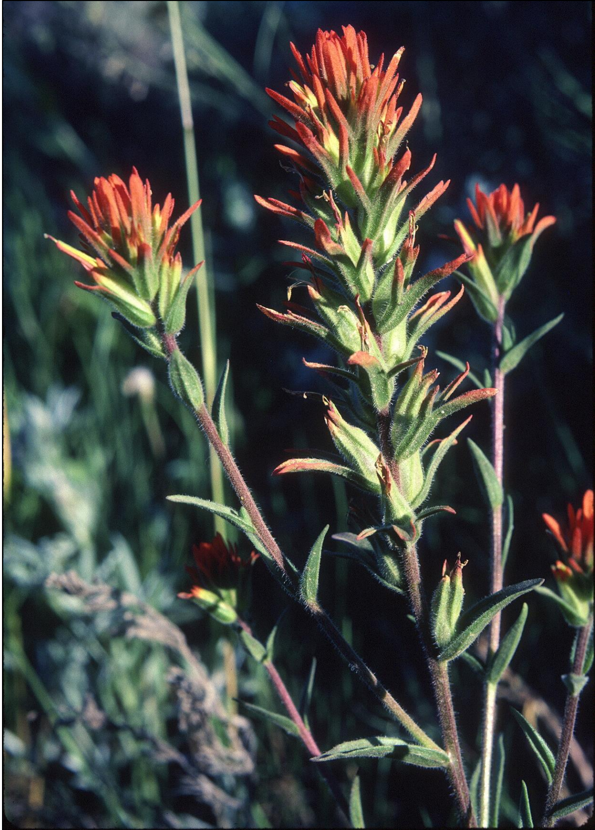
Figure 6. Castilleja peckiana , ca. 13 mi. SE of Page Springs along Steens Mountain Loop Road, Harney Co., Oregon, 1 July 1985, Egger 131 (WTU).