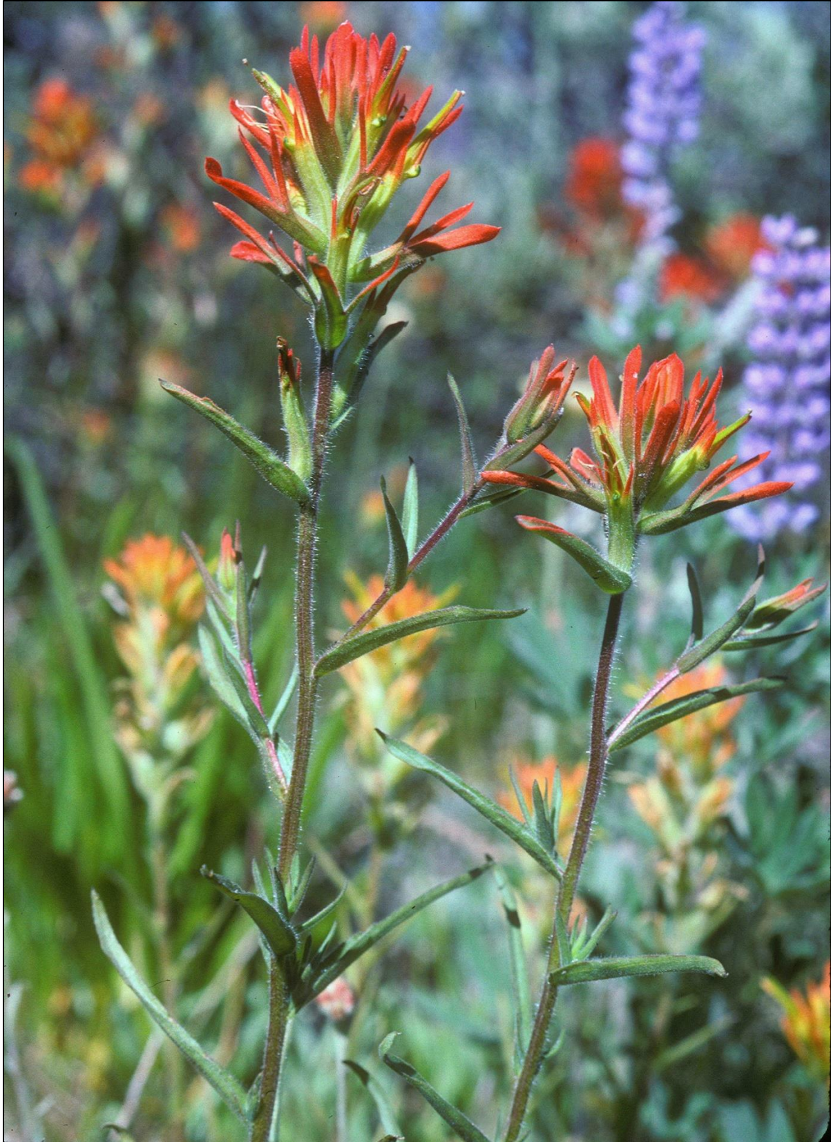
Figure 5. Castilleja peckiana , Steens Mountain Loop Road below Fish Lake, Harney Co., Oregon, 10 July 1994 (no collection).