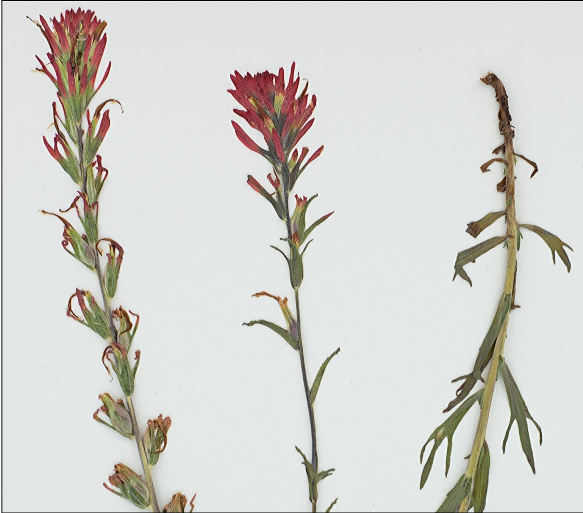
Figure 2. Castilleja peckiana , Devil's Garden area, Modoc Plateau, Modoc Co., California, 11 June 2018, Janeway 12627, CHSC. Details of two inflorescences and lower stem.