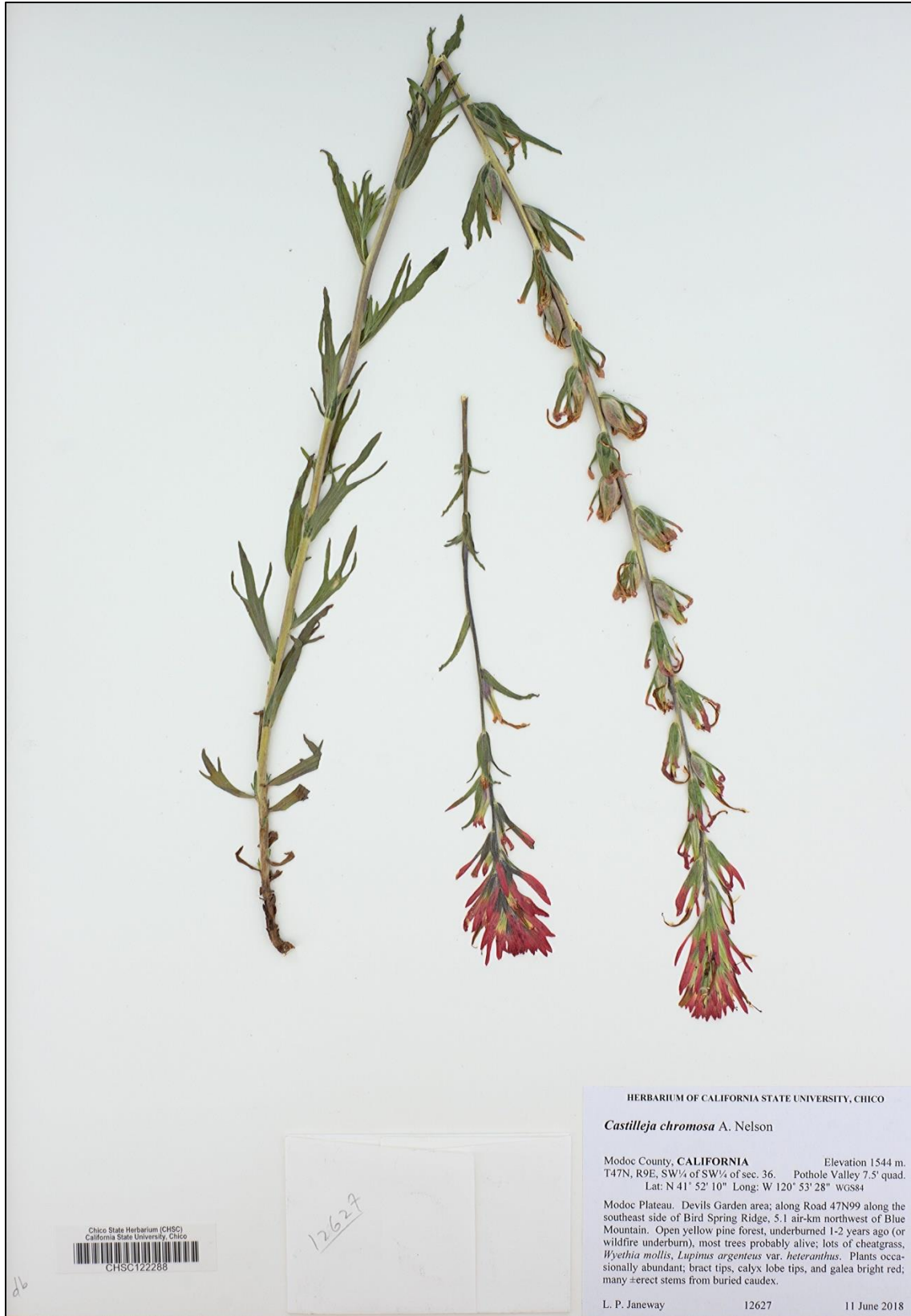
Figure 1. Castilleja peckiana , Devil's Garden area, Modoc Plateau, Modoc Co., California, 11 June 2018, Janeway 12627, CHSC.