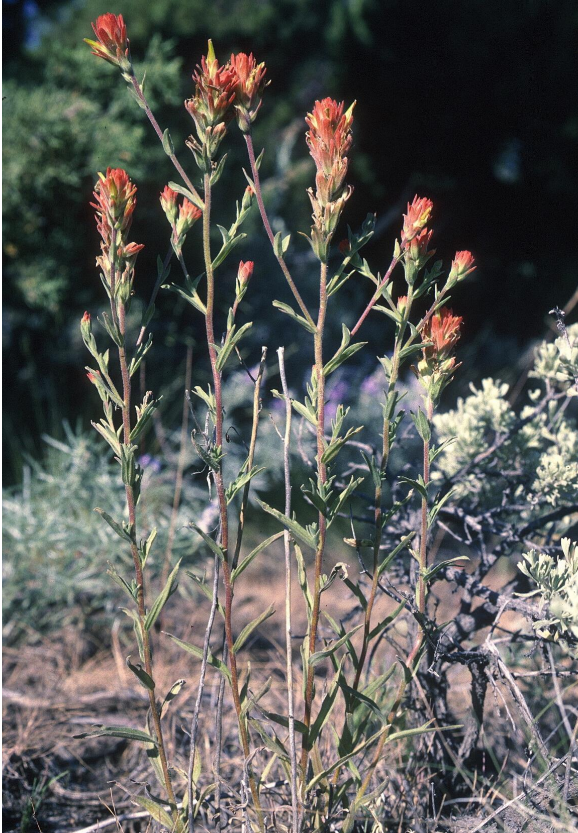
Figure 4. Castilleja peckiana , 6-7 mi SE of Page Springs along Steens Mountain Loop Road, Harney County, Oregon, 10 Jul 1994, Egger 651 (WTU).