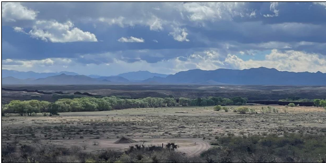
Figure 1. San Bernardino National Wildlife Refuge. Photo by C.M. Roll, 24 Mar 2024.

Umber, R.E. 1979. The genus Glandularia (Verbenaceae) in North America. Syst. Bot. 4: 72–102.