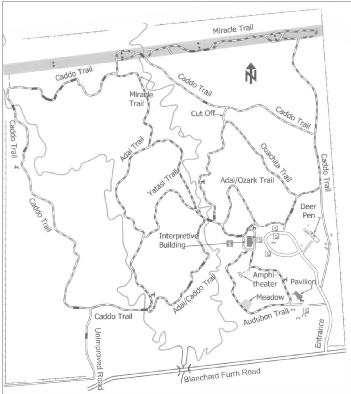
Figure 2. Map of Walter B. Jacobs Memorial Nature Park showing the trail system, two bayous, and the American Electric Power right-of-way (shaded).

florida , Ilex decidua , Sassafras albidum , and Vaccinium arboreum are common throughout the Park. The higher, drier areas, especially in the northeast corner of the Park, are characterized by pine-hardwood forests. Trees of Pinus echinata , characteristic of the original pine-oak-hickory association, are still present and dominant in some areas, although Pinus taeda has become dominant in much of the Park. The last timber harvest on the site occurred in the mid-1950s and focused on the uplands in the eastern third of the Park. Most of the trees in this area are even-aged, recruited immediately after the cut, but scattered trees spared in the last harvest date back to the 1870s (JMK, tree core samples). The uplands and the floodplains in the western two-thirds are less even-aged, with dominant trees now