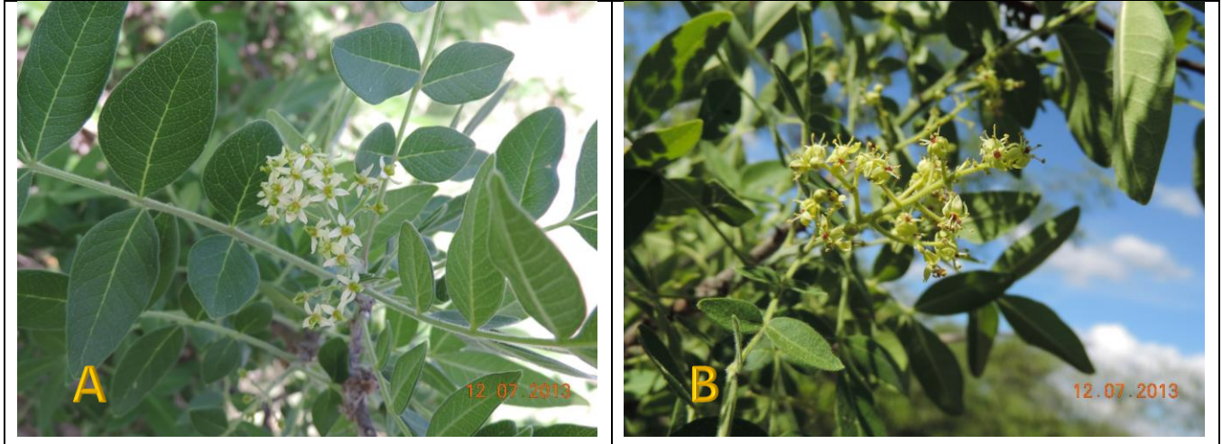
Figure 3. Zanthoxylum arborescens . A. Plant with female inflorescence. B. Plant with male inflorescence.